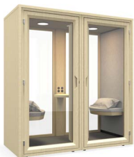
Built-in Seating SBL