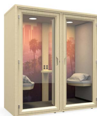
Custom Graphic GRA