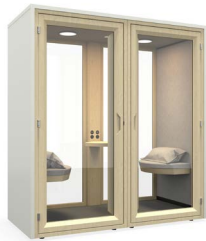
1.5" LPL M36