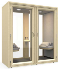
Glazed Front & Back PMP-GGB