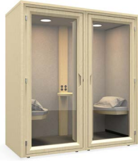
Glazed Front, Upholstered back PMP-GPB