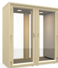
Custom Seating SCU