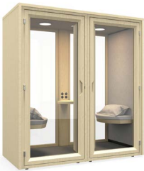
1.5" Ply P36