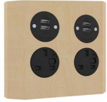
Power Module UPW